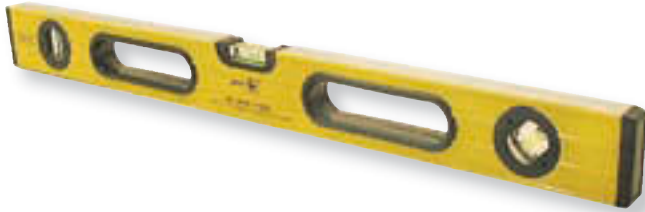
Top read centre vial