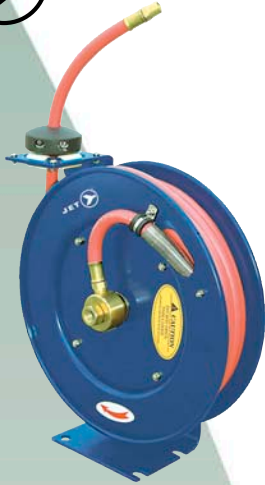
391721 3/8" x 25' Air/Water