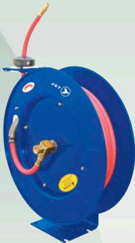
391726 1/2" x 50' Air/Water