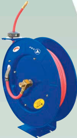
391722 3/8" x 50' Air/Water