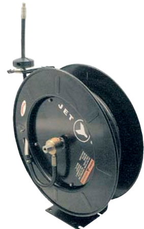
391731 5,000 PSI Grease