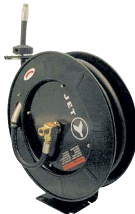
391747 2,000 PSI Oil