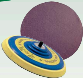
905310 6" PSA TYPE