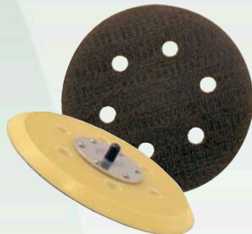
905317 6" PSA VACUUM TYPE