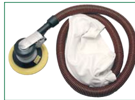
DA63SG Self generated dust collection system

Standard Accessories: Crush resistant hose, Reusable collection bag, 6" PSA 6 hole sanding pad (905317), Wrench