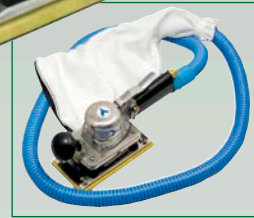
OS37SG Self generated dust collection system