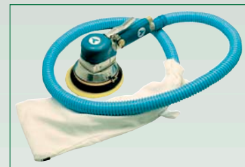
DA65SG Self generated dust collection system