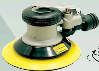
Central dust collection model