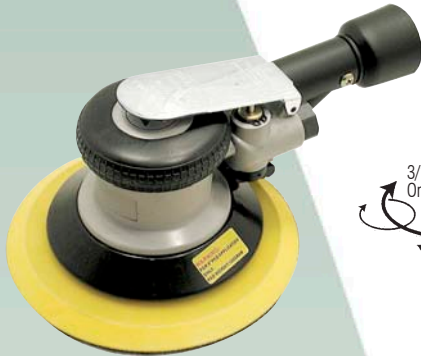
Self generated dust collection model